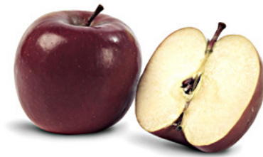
Apple with Seeds

3. How are the seeds of an angiosperm different than the seeds of a gymnosperm?