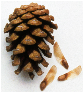
Pine Cone with Seeds

2. How is pollination similar in both types of plants?